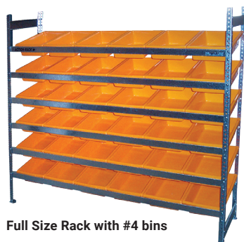
Full Size Rack with #4 bins

For bin colour, add to code: BLU = ■ RE = ■ WH = ■ eg. Unit with white bins = RE S AL1207WH