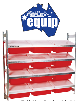
Full Size Rack with #10 bins (optional lids)