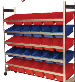
Full Size Rack with Model 30 & Model 30D bins, Mobile option