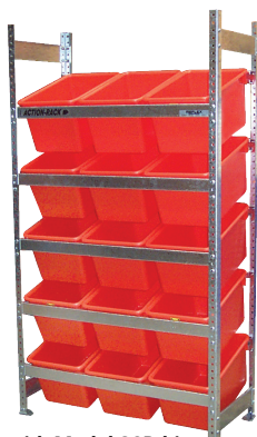
Half Rack with Model 30D bins