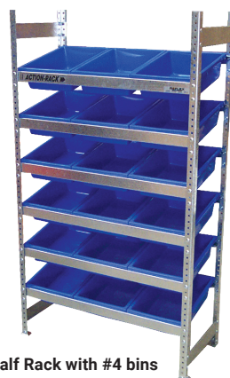
Half Rack with #4 bins