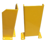
Pallet Racking Legs on Page 150

Contact Reflex Equip on 1300 774 872 for further information & advice